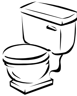
2. Using the bathroom.