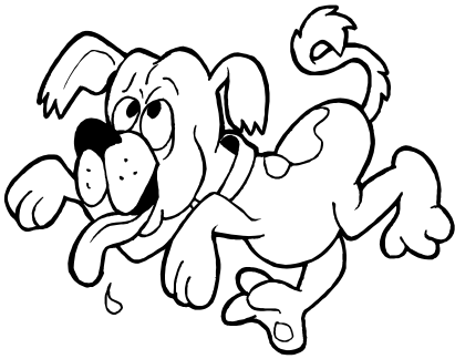
1. Playing with pets.