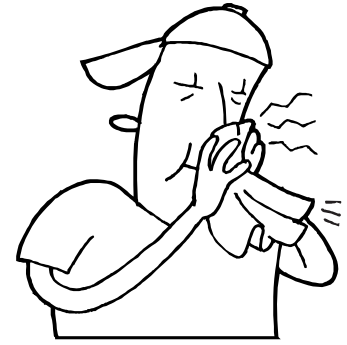
3. Sneezing, blowing your nose or coughing.