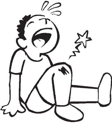
4. Touching a cut or open sore.