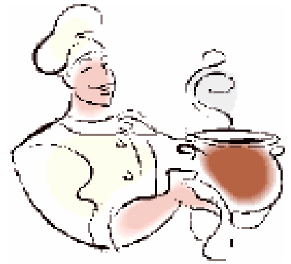
Cooperative Extension Service K-State Research & Extension